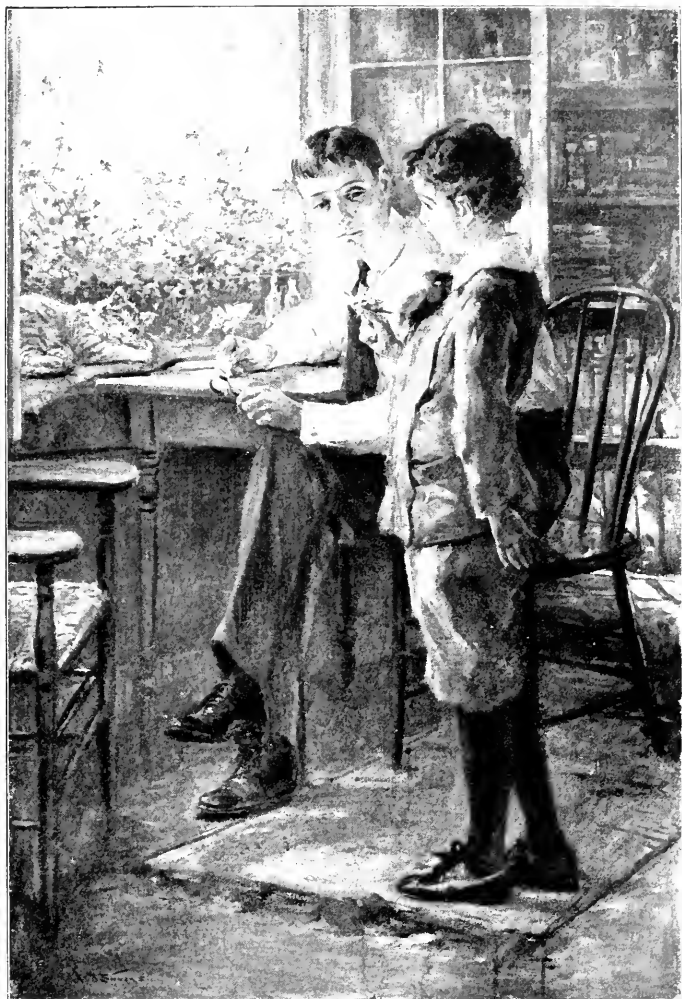
"IT WAS A GREAT BUTTERFLY, MUCH DILAPIDATED AS TO ITS GORGEOUS WINGS"